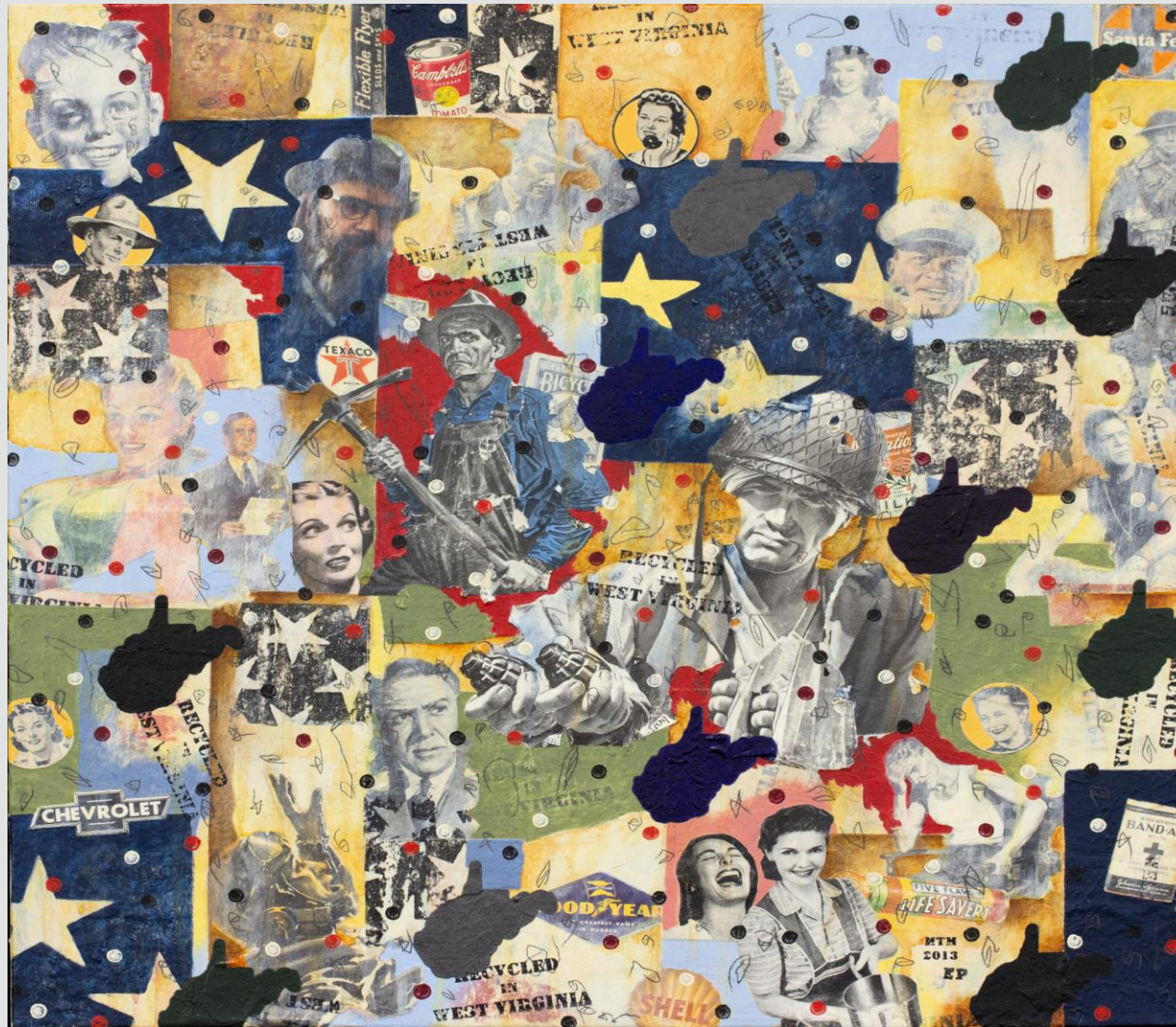
“Recycled in West Virginia: Take Two Aspirins and Call Me in the Morning”, mixed media on canvas, 20x20 inches 2013