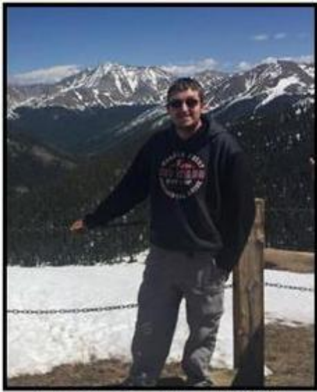
Independence Pass, Colorado (12,095 ft).