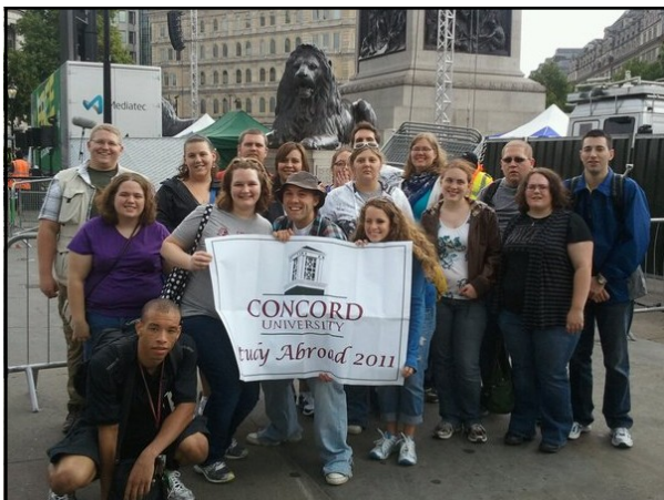
Concord Students at Trafalgar Square on the 2011 Bard Study abroad trip to the United Kingdom

The Russia trip is coordinated through the Social Science division and includes a partnership with Russian faculty and students.