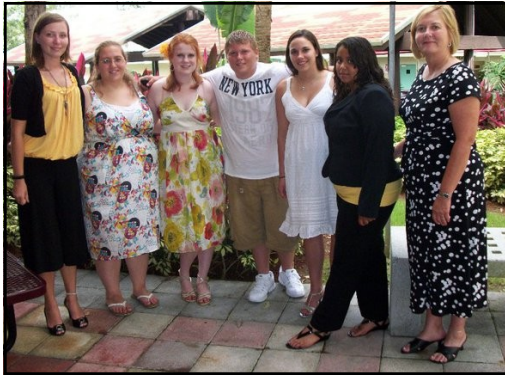
Left : CU in Puerto Rico