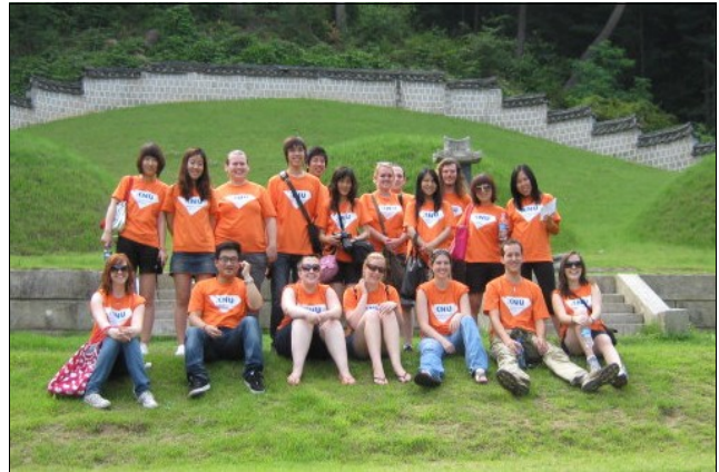
Concord students from the 2010 Korea Japan trip along with Russian, Thai and Korean students.