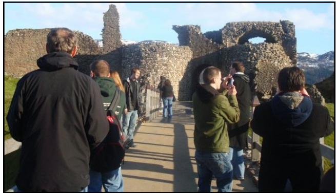
Concord students sightseeing on the 2010 Fine Arts Ireland Trip

on this trip members will tour and perform at various locations.