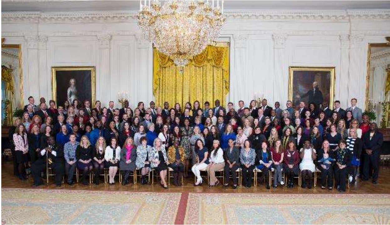
First Lady Michelle Obama joins representative from Healthy Campus Challenge winning schools for a group photo during the Affordable Care Act (ACA) Healthy Campus Challenger Winner Day in the East Room of the White House, Jan 13, 2017.

Disclaimer: This photograph is provided by THE WHITE HOUSE as a courtesy and may be printed by the subject(s) in the photograph for personal use only. The photograph may not be used in any commercial or political materials, advertisements, emails, products, promotions that in any way suggests approval or endorsement of the President, the First Family, or the White House.